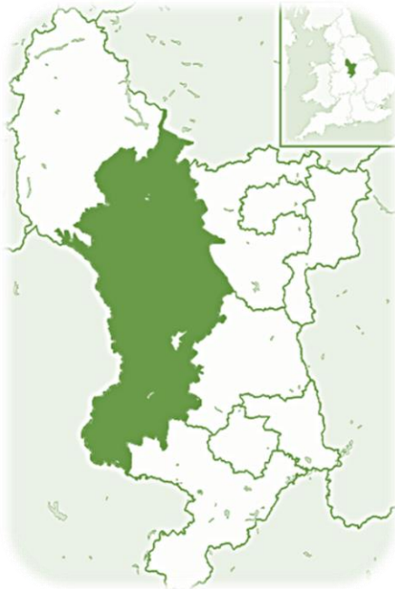
Map of Derbyshire, UK, with Derbyshire Dales highlighted (source: https://upload.wikimedia.org/wikipedia/commons/e/e0/Derbyshire_Dales_UK_locator_map.svg )

Together, we can work with our environmental and social realities to step into an era of sustainable thriving.