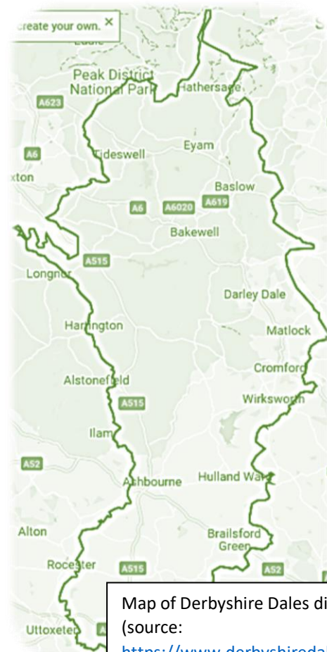
Map of Derbyshire Dales district boundary